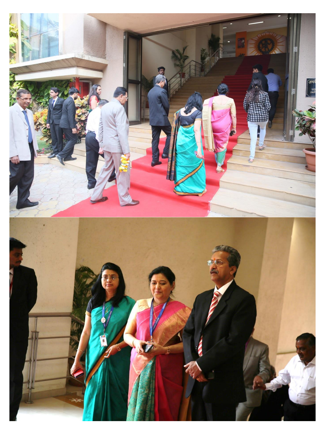
The institute received NAAC accreditation 8^{th} February 2019 with a CGPA of 2.51 for five years after the peer team visit.